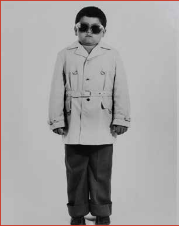
Nathan Farb, Boy with Trench Coat and Sunglasses , 1977